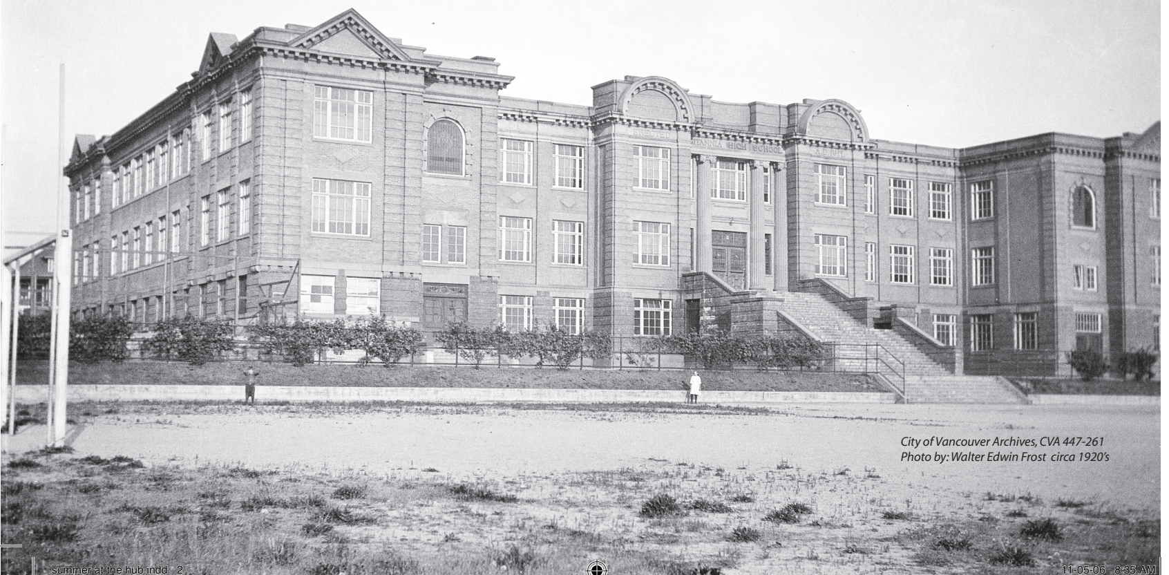
City of Vancouver Archives, CVA 447-261 Photo by: Walter Edwin Frost circa 1920's

The history behind the Britannia Community Center is a story of neighbourhood action in response to a government proposal to build a freeway through the current property. Dedicated and committed groups and individuals convinced the City to create a true community center on the Britannia site, that would serve every member of the neighbourhood and they did just that. The Vancouver School, Parks and Library Boards all cooperated, (and still do) creating something very special and unique. Their continuing cooperation and grassroots response to this community's needs have made this 18 acre complex an exciting, vibrant and progressive community complex.